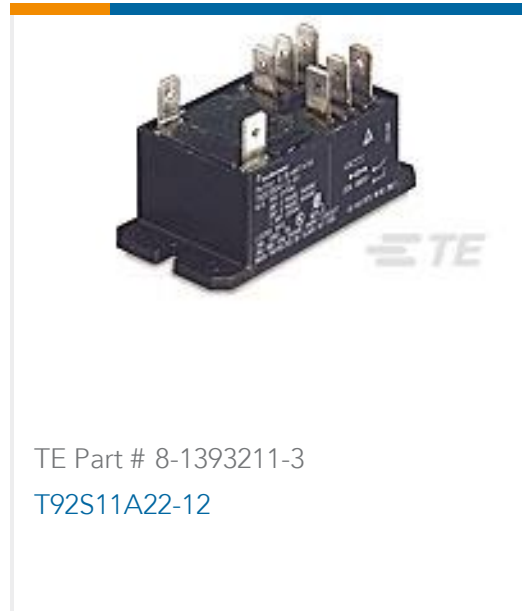
TE Part # 8-1393211-3 T92S11A22-12